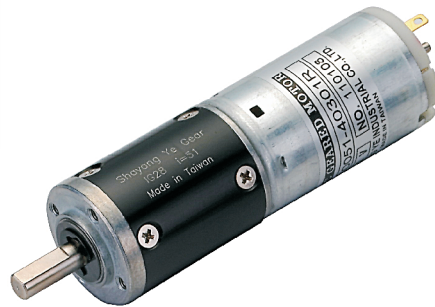
外形尺寸 APPEARANCE SIZE