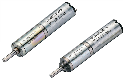
外形尺寸 APPEARANCE SIZE